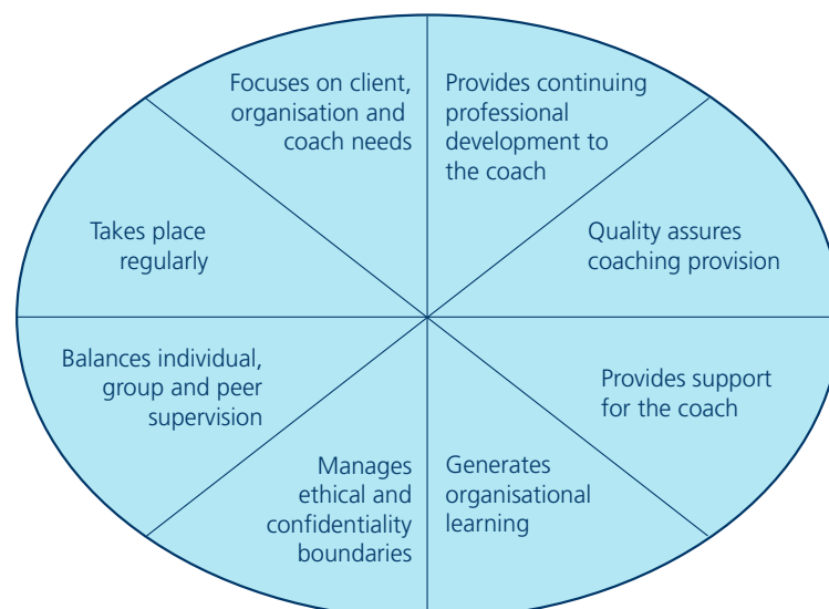
Figure 2: Coaching supervision: wheel of good practice